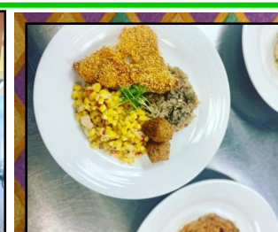
Mardi Gras Feast!