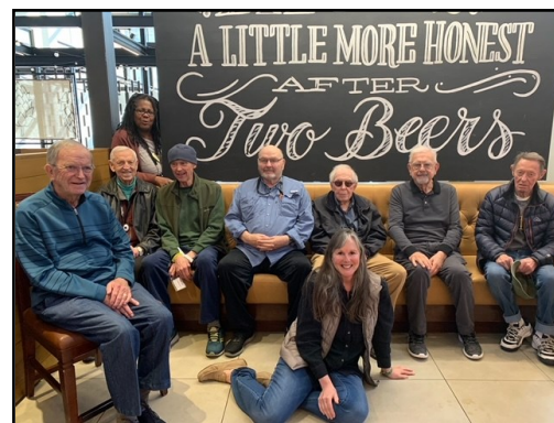
ROMEO Lunch Outing