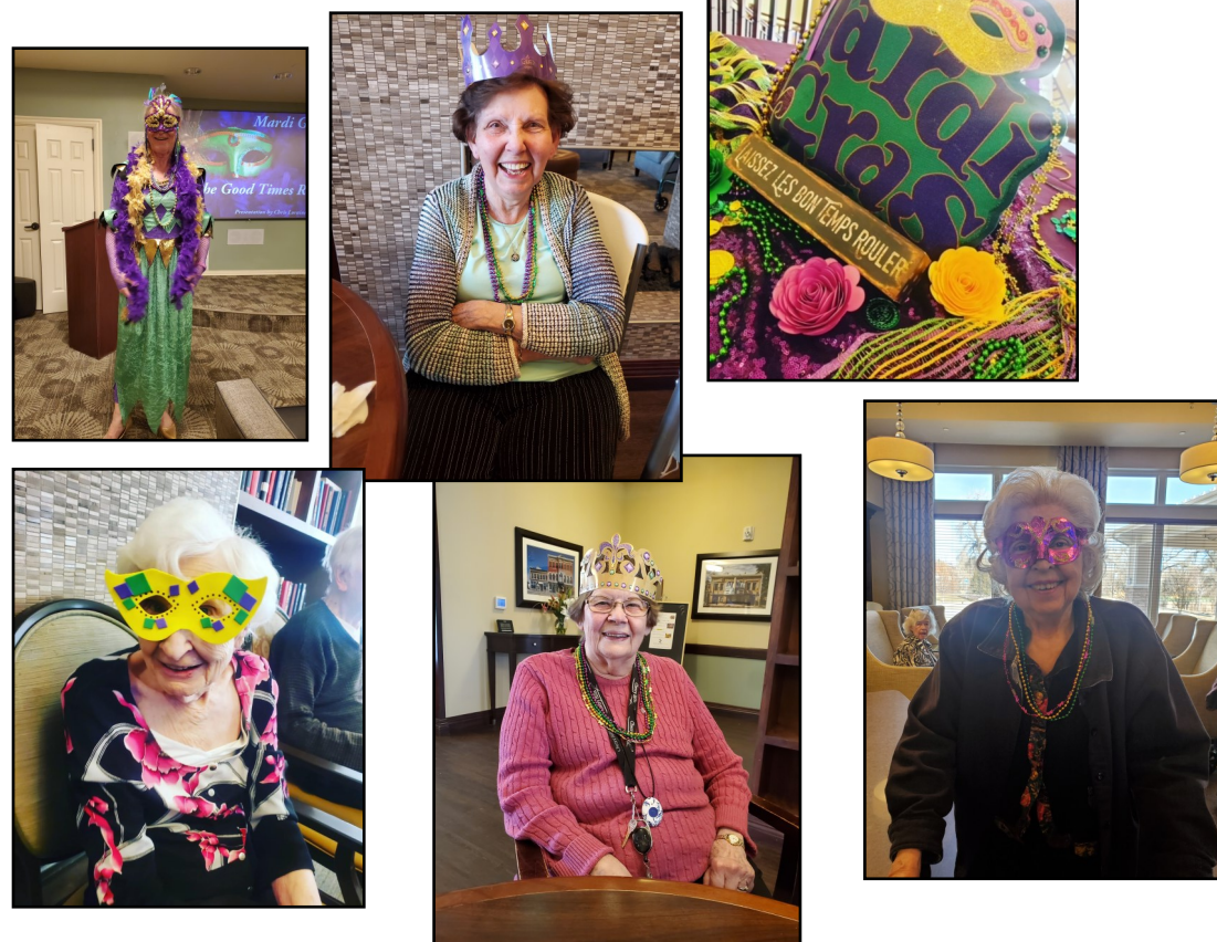
Celebrating Mardi Gras at CHAL!