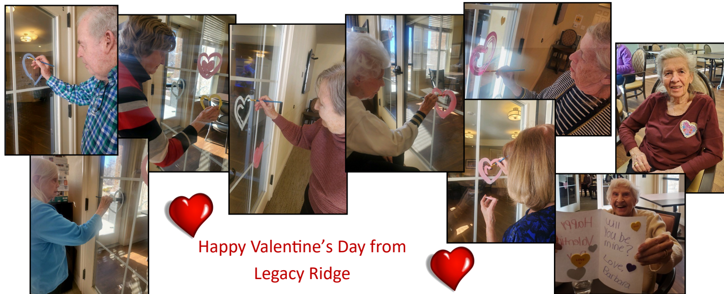
Happy Valentine's Day from Legacy Ridge