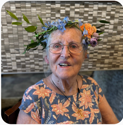
FRESH FLOWER CROWNS