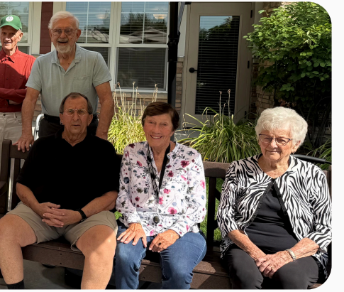
PRETTY IN PINK ❤️